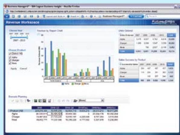
Access and view financial information from IBM Cognos TM1 and sales reports side by side.